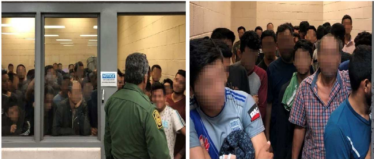
Figure 4. Standing room only for adult males observed by OIG on June 10, 2019, at Border Patrol’s McAllen, TX, Station.