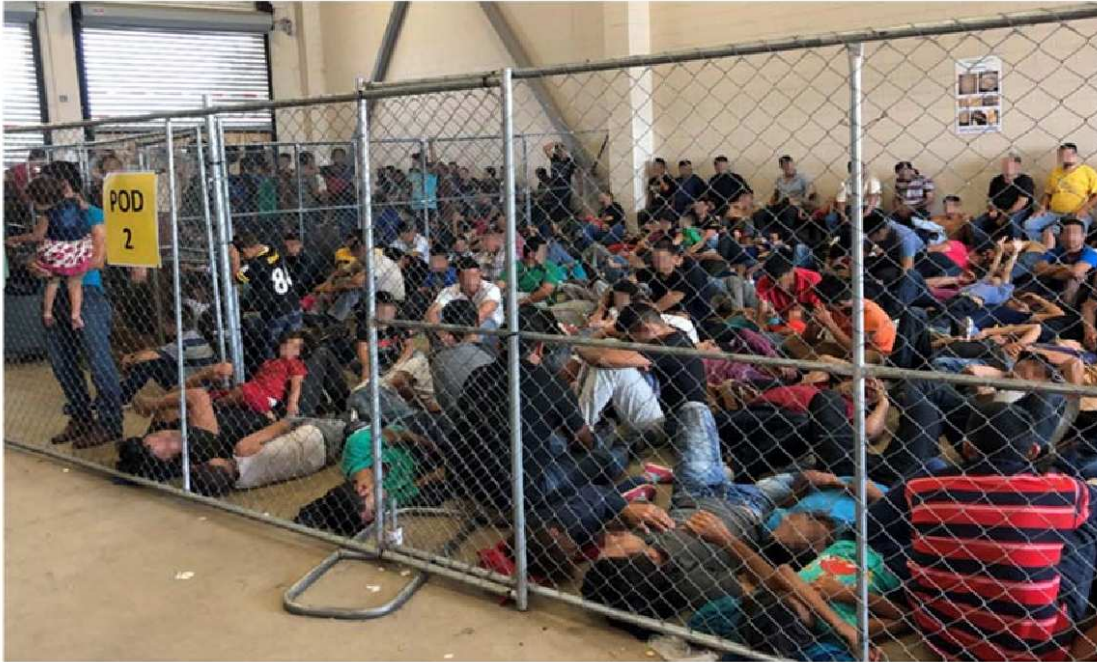
Figure 1. Overcrowding of families observed by OIG on June 10, 2019, at Border Patrol’s McAllen, TX, Station.