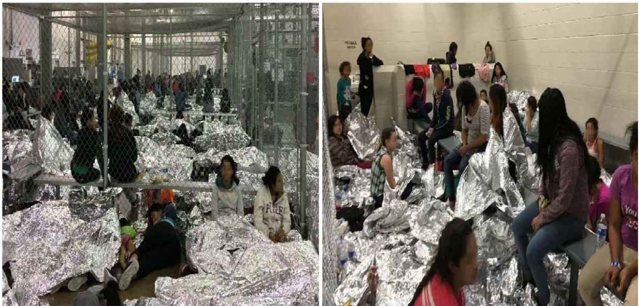
Figure 2. Overcrowding of families observed by OIG on June 11, 2019, at Border Patrol’s McAllen, TX, Centralized Processing Center.